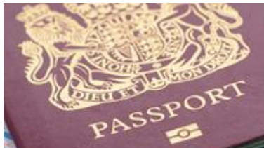
UK passport displaying ePassport symbol